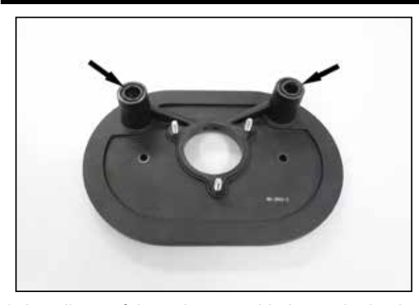
8. Install two of the o rings provided onto the back side of the K\&N^{@} back plate as shown.