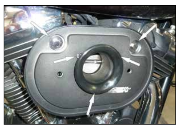
10. Install the filter back plate onto the throttle body and secure first with the throttle body bolts and then with the breather bolts.

NOTE: Be sure to install the two provided O-Rings into the receiver groves on the back of the back plate.