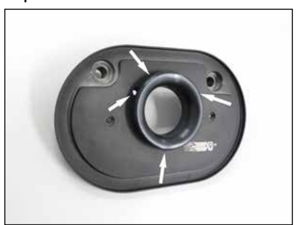
7. Install the provided intake velocity stack and the three throttle body bolts in the K&N® back plate.