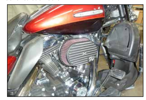
12. Attach cover plate with provided socket head Allen screw.