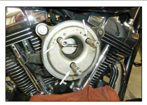
4. Remove the three back plate retaining bolts shown.