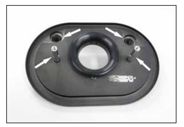
9. Install the remaining two o rings and the two filter spacers onto the front of the K&N<sup>®</sup> back plate as shown using the provided hardware.