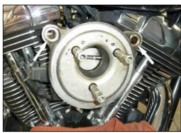
Remove the two vent bolts.