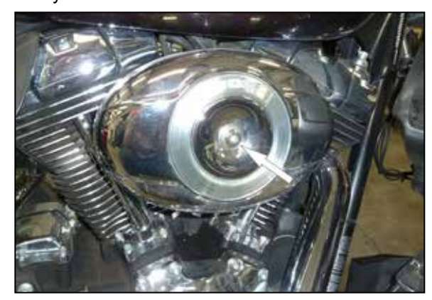
2. Remove the Allen screw that attaches the air

1. Turn off the ignition and disconnect the negative battery cable.