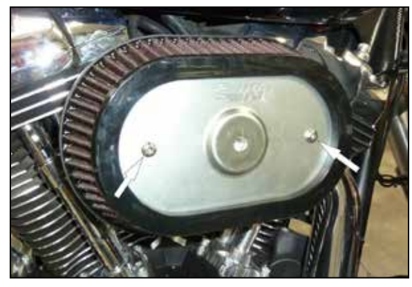
11. Place the K&N® filter on the back plate and attach with the remaining button head screws. NOTE: Apply one drop of provided thread locker to each screw.

NOTE: On applications that have had the support bracket removed, install the two provided spacers between the back plate and cylinder head at the breather holes and then install the breather bolts as shown