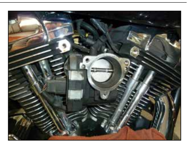
6. Remove the backing plate. NOTE: K&N Engineering, Inc. recommends that customers do not discard the factory air intake components.